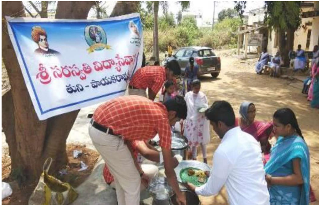
FOOD DISTRIBUTION BY SPACES DEGREE COLLEGE NSS VOLUNTEERS