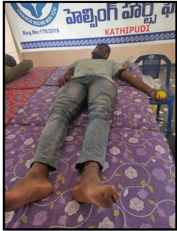
STAFF AND STUDENTS DONATING BLOOD IN THE TUNI AND KATHIPUDI GOVT. HOSPITALS