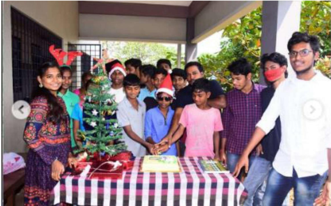
SPACES DEGREE COLLEGE ROTARACTORS AT THE CHILDREN'S HOME

( Under the Management of SRI PRAKASH EDUCATIONAL SOCIETY )