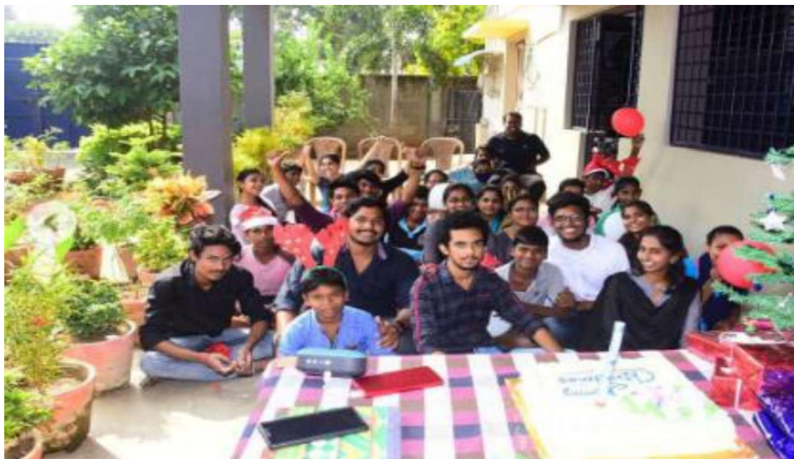
SPACES DEGREE COLLEGE ROTARACTORS AT THE CHILDREN'S HOME

The ROTARACT CLUB OF SABALA and YOUNG LEADERS visited the Children's home at S.Narsapuram on Christmas. Rotaractors planned and organised various activities for the children. The most cheerful thing on Christmas for children is the gifts, so gifts were planned. Fun and Knowledge oriented games were conducted and prizes were given. Rotaractors shared their experiences in school and college and suggested them things which would be helpful in building their character and personality. Both Rotaractors and children really had a great time and the Christmas celebrations ended with the cake cutting and distribution. The home's caretaker appreciated the SPACES Rotaractors for the lovely gesture. 10 SPACES Rotaractors participated in the event.