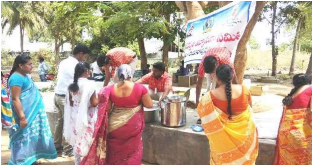
FOOD DISTRIBUTION BY SPACES DEGREE COLLEGE NSS VOLUNTEERS